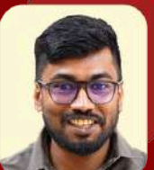
NIDHIN R H AIR 699 PCM, PSIR