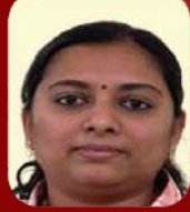
K R LAKSHMI AIR 376 MTS, IMP