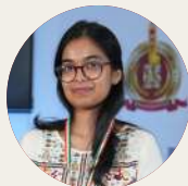
Swathi S Babu, IFS