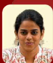
ANUSHA A S AIR 284 IMP