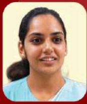
VISHNUPRIYA AIR 149 IMP