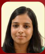
ANJANA B AIR 222 PCM