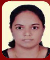
GOPIKA B AIR 105 MTS & IMP