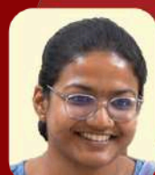
S KAVYA AIR 916 SOCIOLOGY