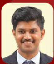
SIDHARTH M JOY AIR 273 IMP