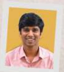
SHIYAD AIR 743