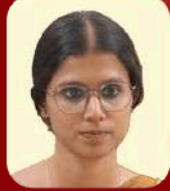
SANDHRA S AIR 380 PCM