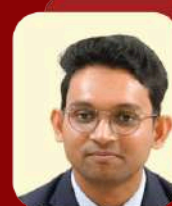
AMAL KAMPIYIL AIR 362 PCM & PSIR