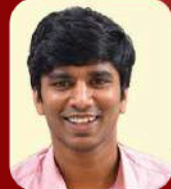
SHIYAD AIR 743 PCM PSIR